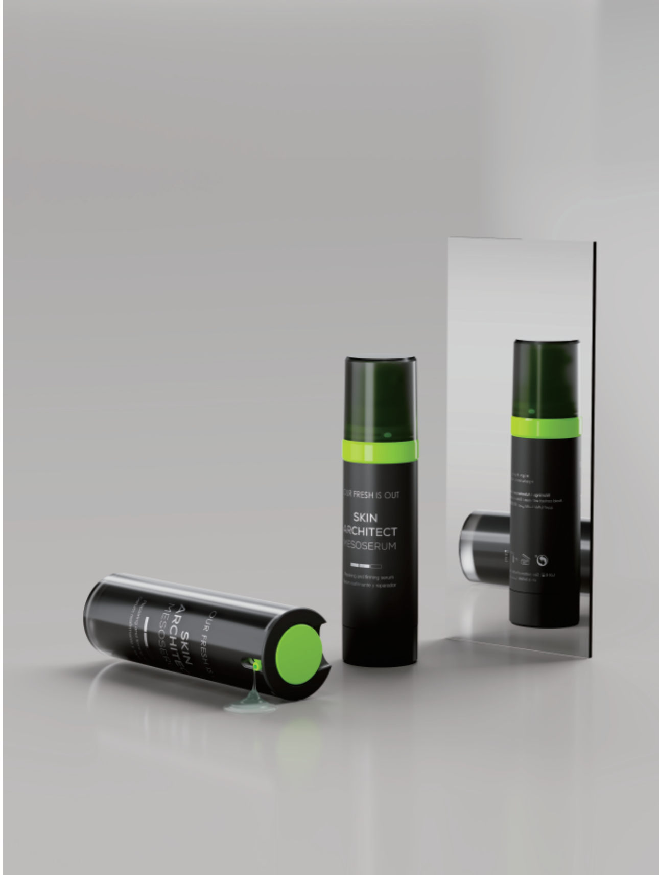
ZK203 | ZK205