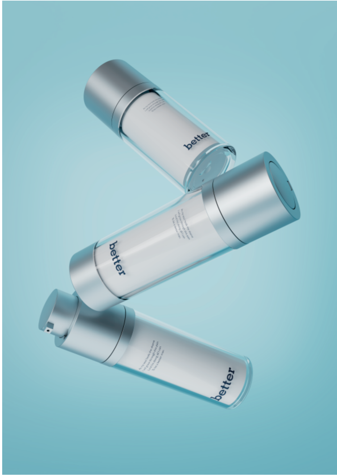
Zk202 | ZK258